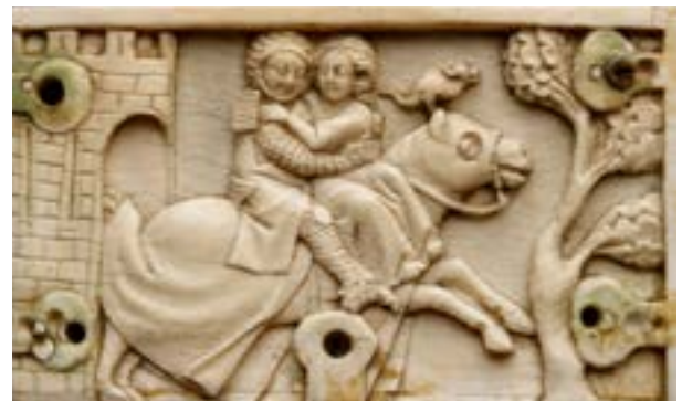
Casket panel showing a knight and his lady, ivory, 1350-1400, unprovenanced AN2008.27