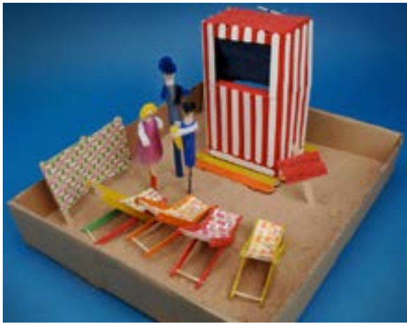
3D seaside scene inspired by Sickert's 'Brighton Pierrots.'