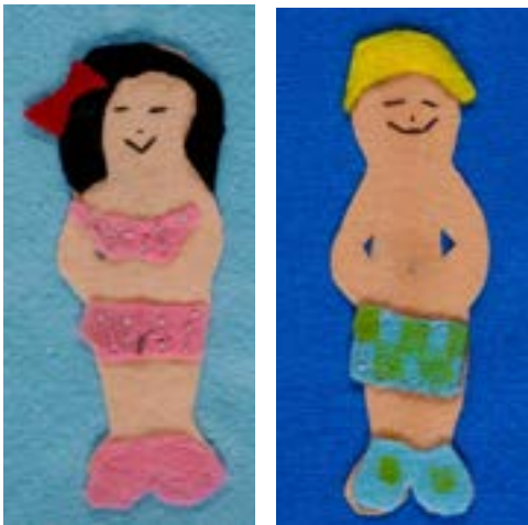
Swimwear designs inspired by Sickert's 'Brighton Pierrots'